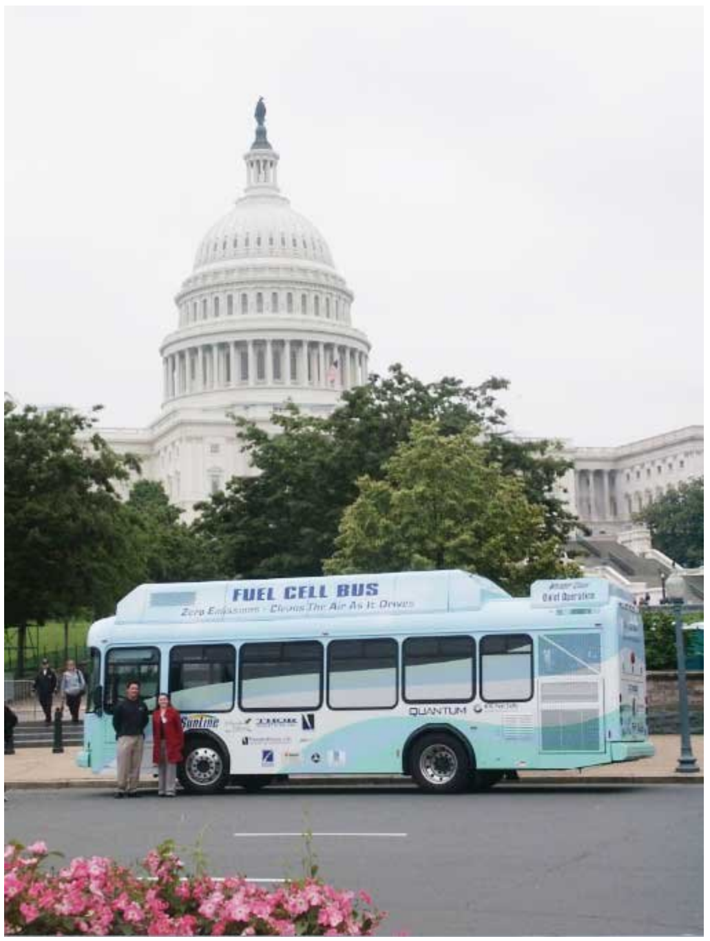
Sunline Fuel cell bus in Washington DC.