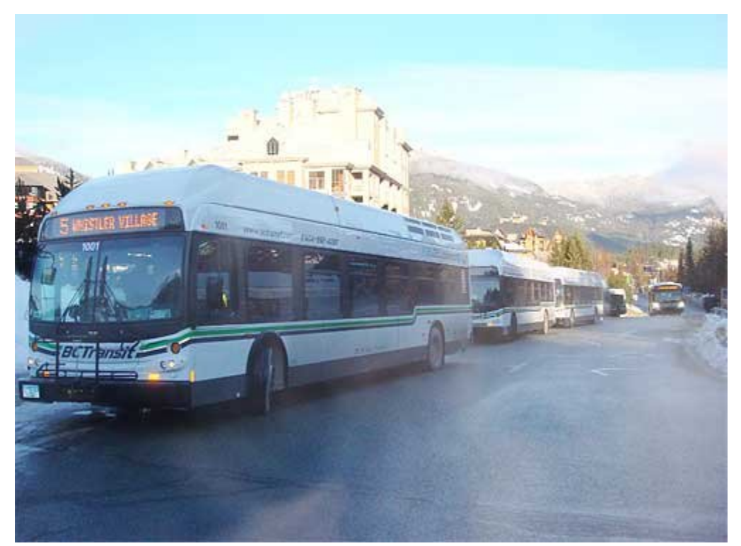
BC Transit Hydrogen Bus in Whistler Vancouver Canada for 2010 Winter Olympics.