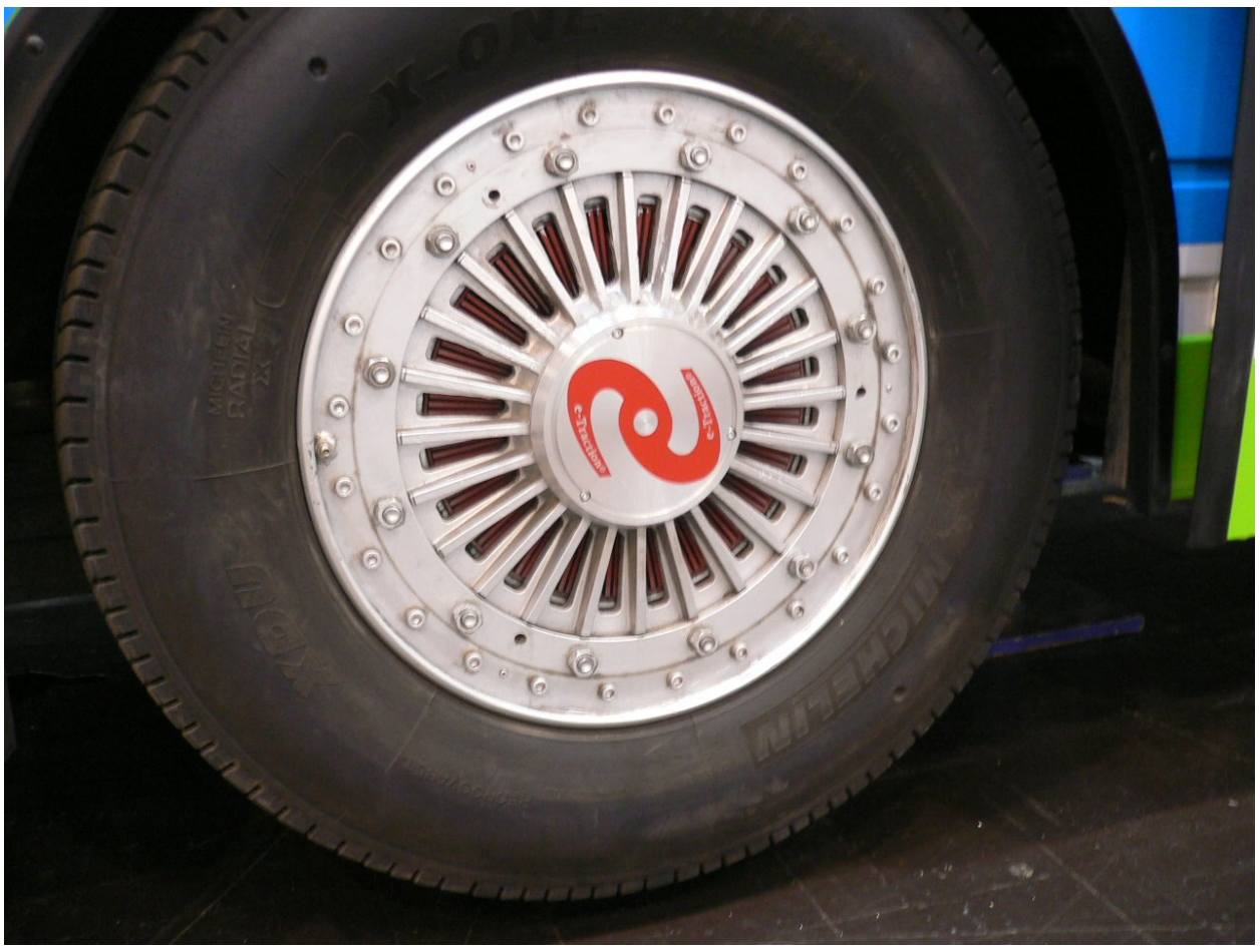
Up-close of the wheelmotor cooling.