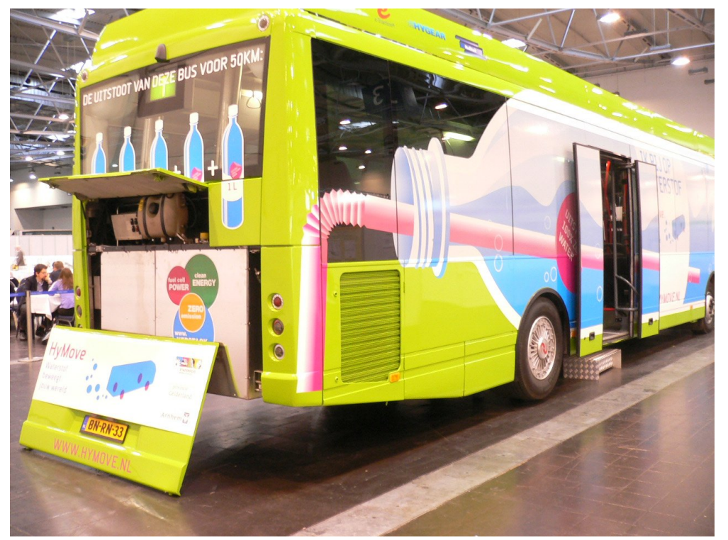
The e-Traction Bus on a VDL chassis.