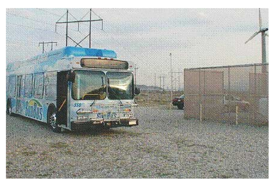
SunBus near wind turbine

Find more info at <a href="hydrogencarsnow.com">hydrogencarsnow.com</a>