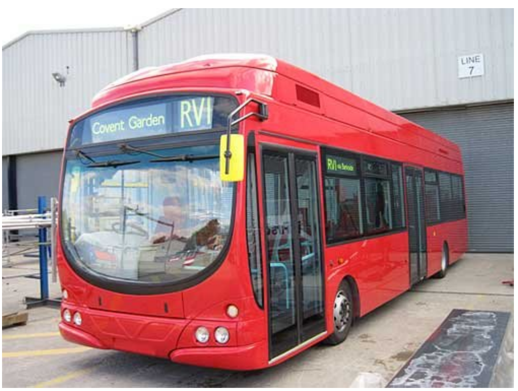
RVI Curbside H2 Bus