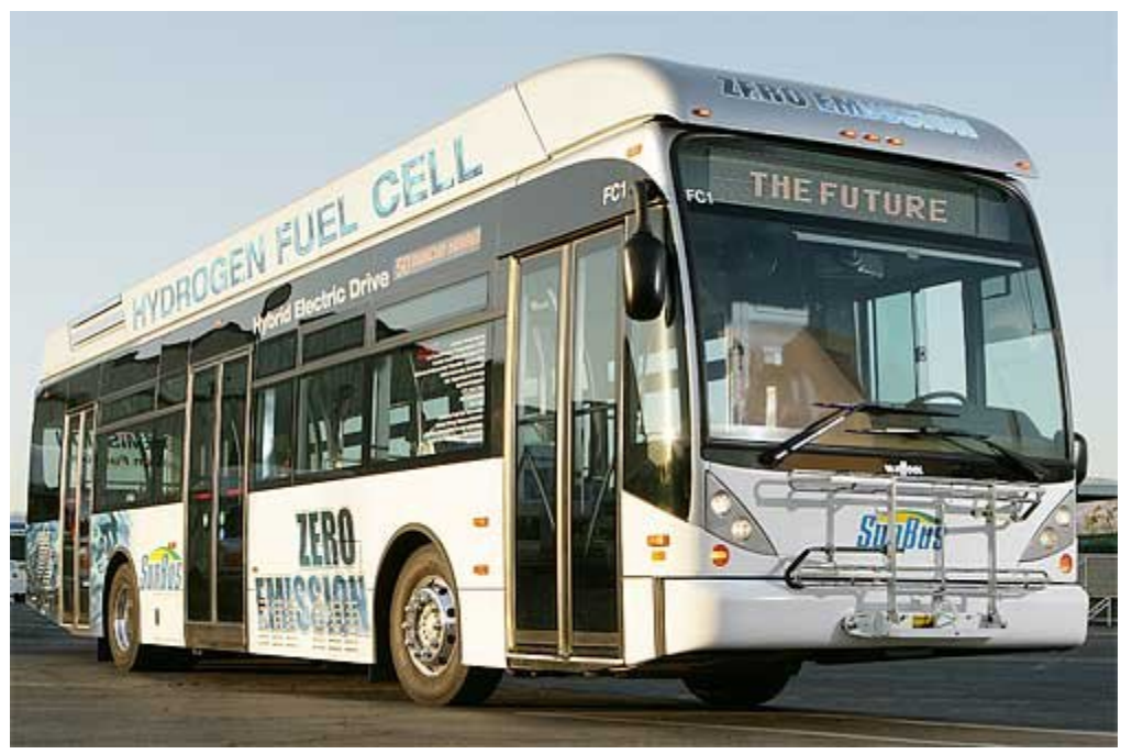
SunBus hydrogen fuel cell bus with hybrid electric system.